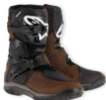
82 BROWN BLACK