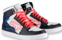
1237 BLACK WHITE RED BLUE