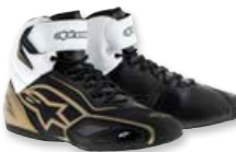
11059 BLACK WHITE GOLD