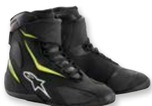
155 BLACK YELLOW FLUO