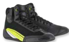
155 BLACK YELLOW FLUO