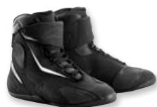
1100 BLACK BLACK