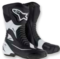
12 BLACK WHITE