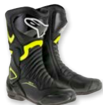
155 BLACK YELLOW FLUO