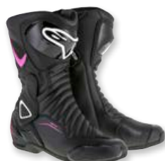
1032 BLACK FUCHSIA WHITE