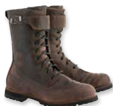
819 DARK BROWN OILED