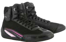
1239 BLACK WHITE FUCHSIA