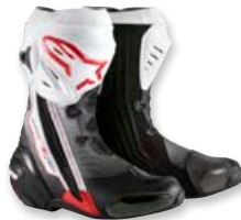
132 BLACK RED WHITE