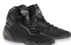
1101 BLACK GUN METAL