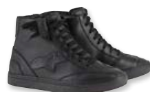
1110 BLACK BLACK