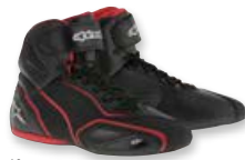
13 BLACK RED