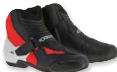
123 BLACK WHITE RED

CO-INJECTED TPU/ALUMINUM TOE-SLIDERS AVAILABLE AS ACCESSORY UPGRADE (COMPATIBLE WITH OTHER ALPINESTARS RACING BOOTS).