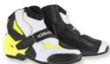
125 BLACK WHITE YELLOW FLUO