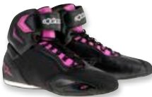
1039 BLACK FUCHSIA