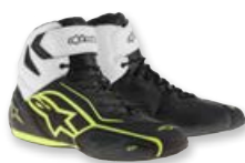
125 BLACK WHITE YELLOW FLUO