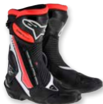
233 WHITE BLACK RED FLUO