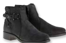
110 BLACK MATT