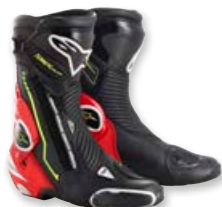
1325 BLACK RED FLUO WHITE YELLOW FLUO