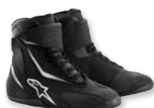
12 BLACK WHITE