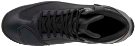
13 BLACK RED