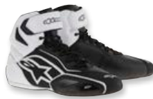
12 BLACK WHITE