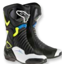
127 BLACK WHITE YELLOW FLUO BLUE