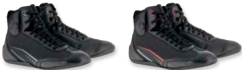
106 BLACK GRAY