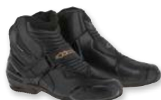
185 BLACK GOLD