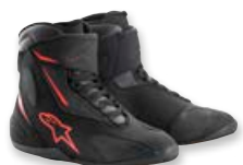
1036 BLACK ANTHRACITE RED