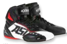
123 BLACK WHITE RED