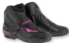
1039 BLACK FUCHSIA