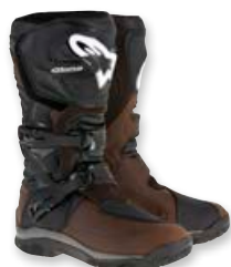
82 BROWN BLACK