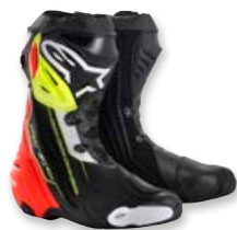
136 BLACK RED YELLOW FLUO