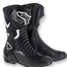
12 BLACK WHITE