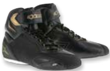
185 BLACK GOLD