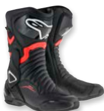
1030 BLACK RED FLUO