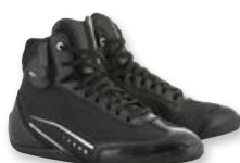
12 BLACK WHITE