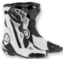
12 BLACK WHITE