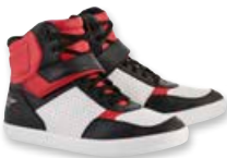
123 BLACK WHITE RED