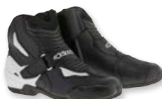
12 BLACK WHITE