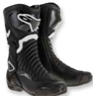
12 BLACK WHITE