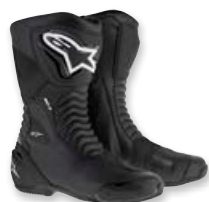
1100 BLACK BLACK