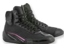
1039 BLACK FUCHSIA