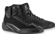
12 BLACK WHITE