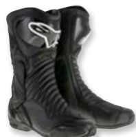
1100 BLACK BLACK