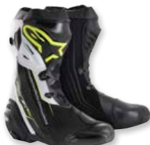
158 BLACK YELLOW FLUO WHITE