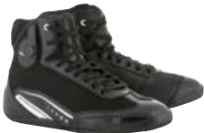
12 BLACK WHITE