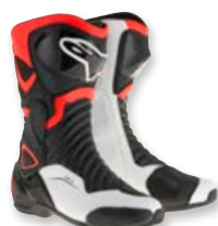
1321 BLACK RED FLUO WHITE