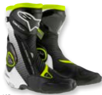
125 BLACK WHITE YELLOW FLUO