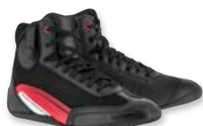
13 BLACK RED