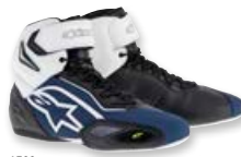
1720 BLACK NAVY WHITE YELLOW FLUO