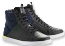
155 BLACK YELLOW FLUO