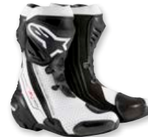
122 BLACK WHITE VENTED