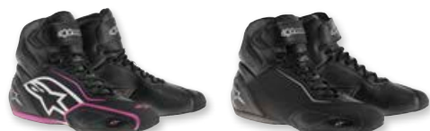
1039 BLACK FUCHSIA