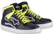
1536 BLACK YELLOW FLUOR RED