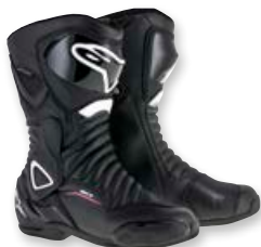
1239 BLACK WHITE FUCHSIA