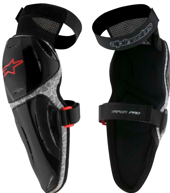
BLACK GRAY // 106