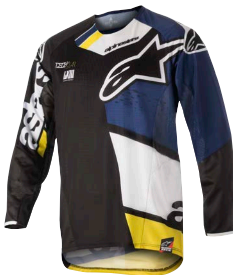
BLACK DARK BLUE WHITE YELLOW // 1725