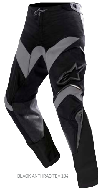
BLACK ANTHRACITE// 104