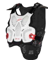
WHITE BLACK RED // 213