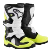
BLACK WHITE YELLOW FLUO // 125