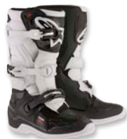
BLACK WHITE // 12