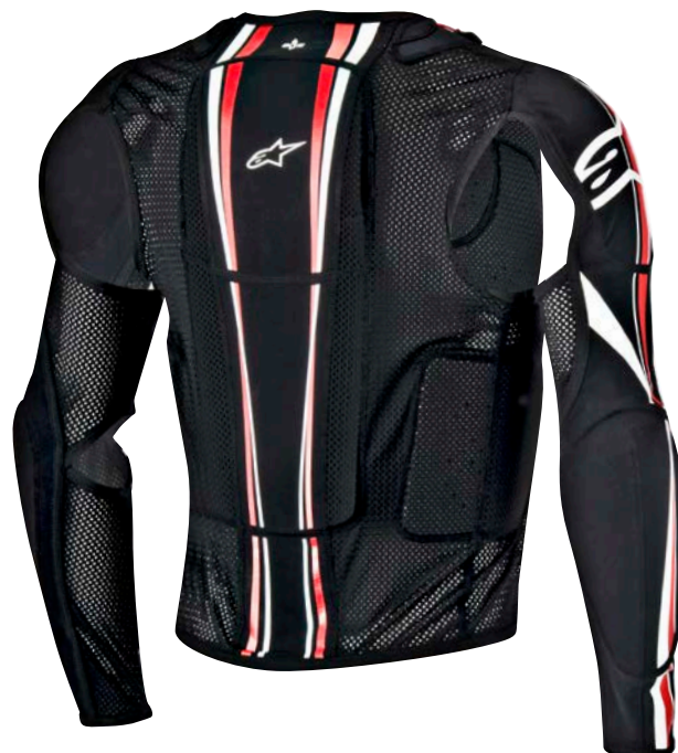
BLACK RED WHITE // 132