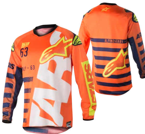
ORANGE FLUO DARK BLUE WHITE // 473