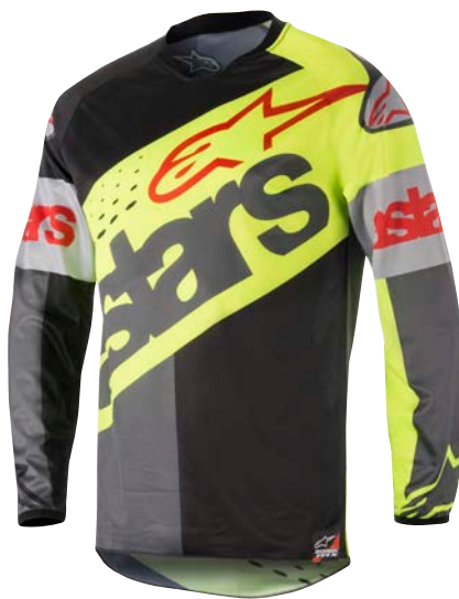
YELLOW FLUO BLACK ANTHRACITE // 519