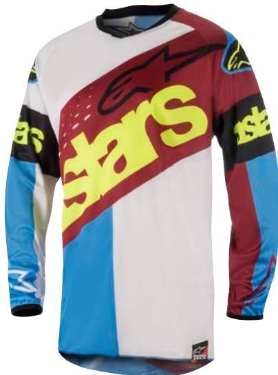
RIO RED AQUA WHITE // 3062