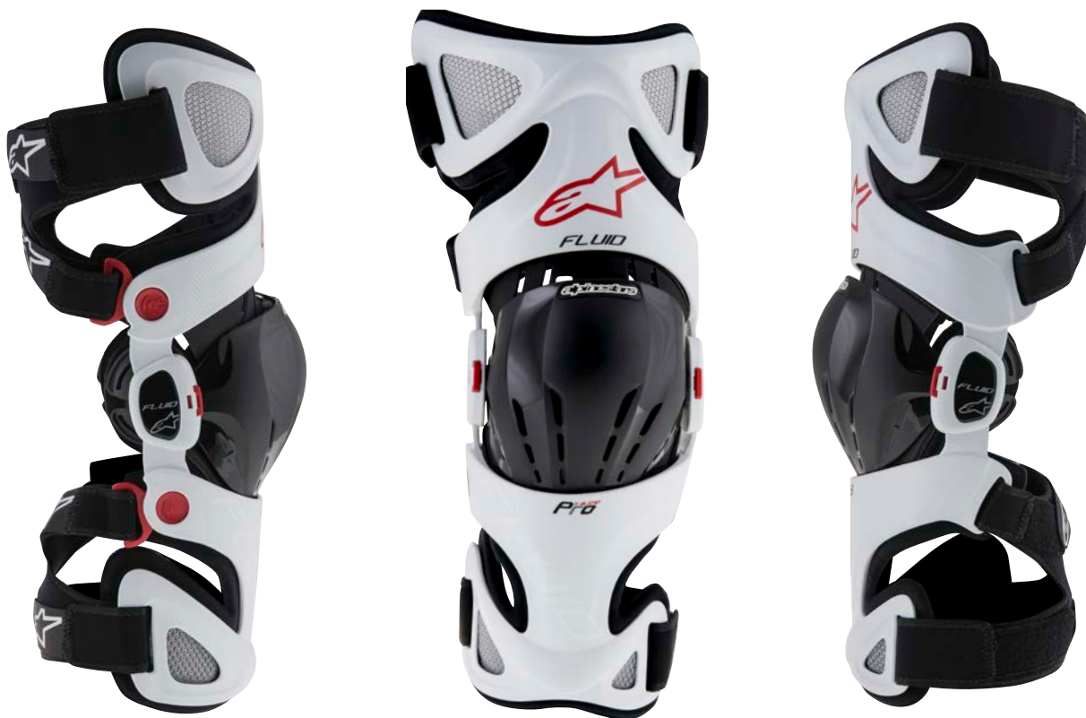
WHITE BLACK RED // 213