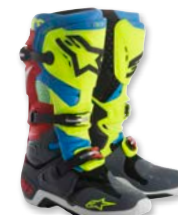
ORANGE FLUO BLUE WHITE YELLOW FLUO // 475