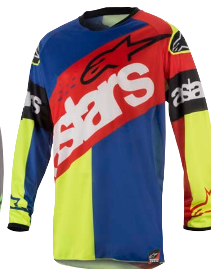
RED YELLOW FLUO BLUE // 356