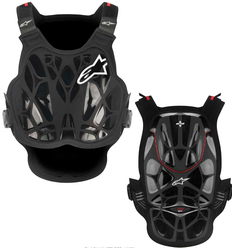
BLACK WHITE RED // 123