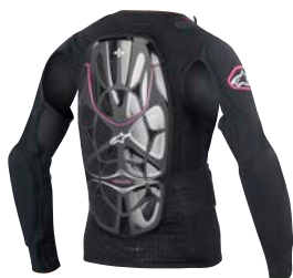
BLACK PURPLE // 1360