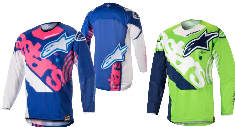
BLUE PINK FLUO WHITE // 7392