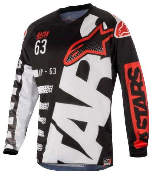
BLACK WHITE RED // 123