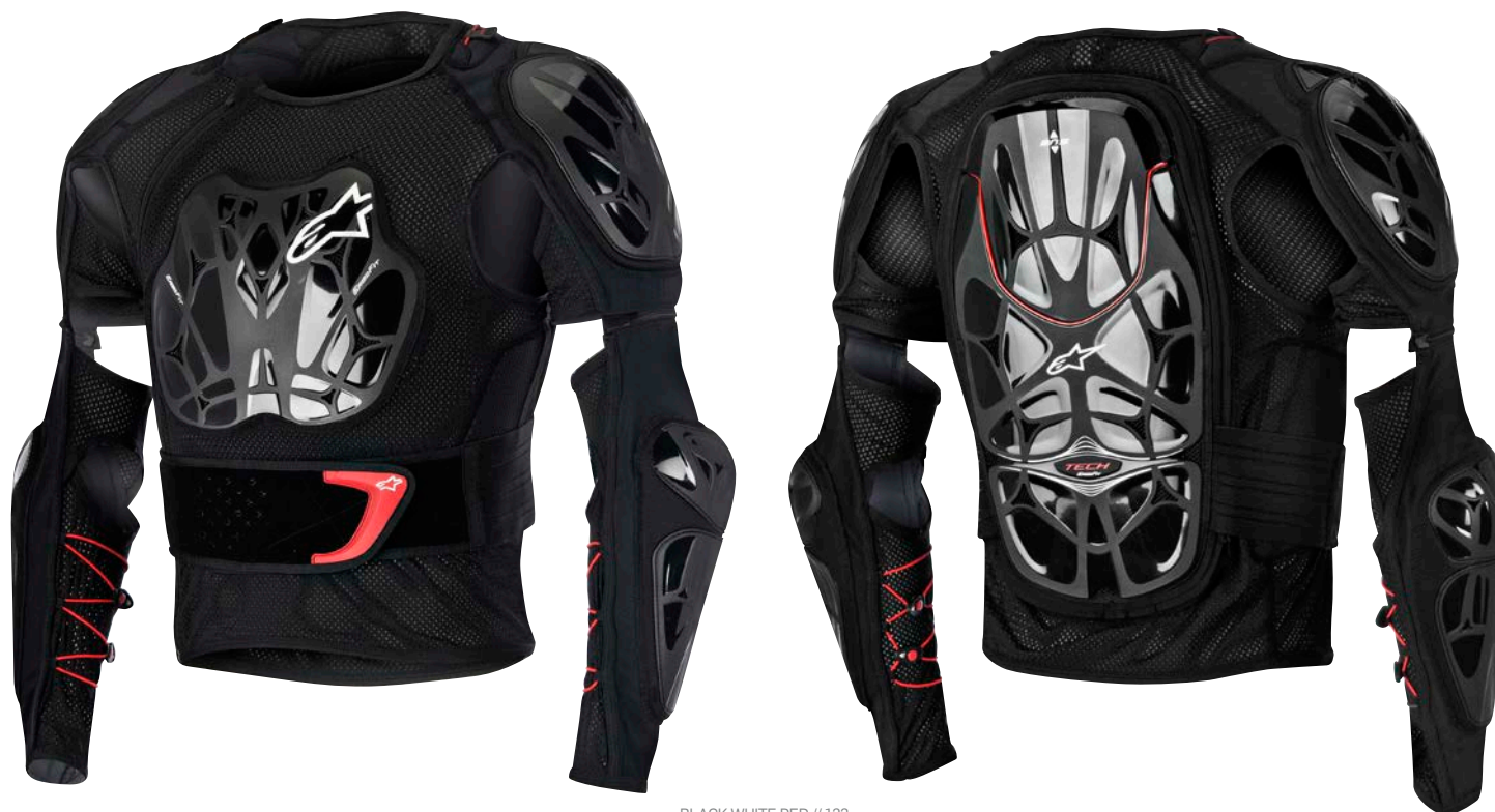
BLACK WHITE RED // 123