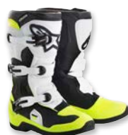
BLACK WHITE YELLOW FLUO // 125