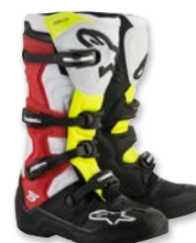
BLACK WHITE RED YELLOW FLUO // 1235