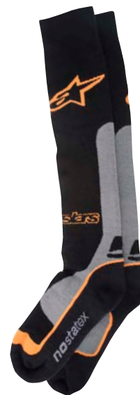
BLACK GRAY ORANGE // 174