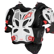
ANTHRACITE BLACK RED // 1431