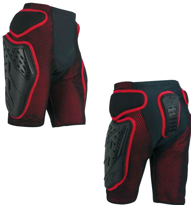
BLACK RED // 13