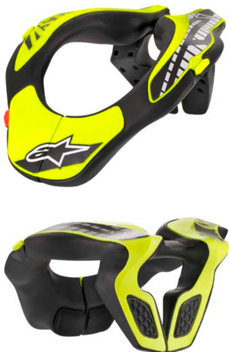
BLACK YELLOW FLUO // 155