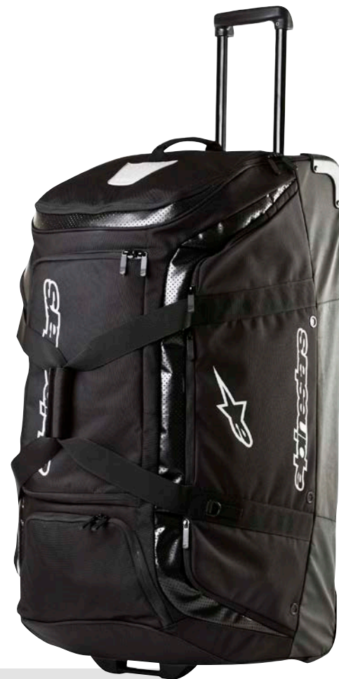
BLACK // 10