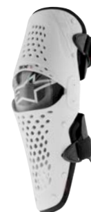
WHITE BLACK // 21