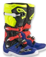
BLUE BLACK YELLOW FLUO RED // 7153