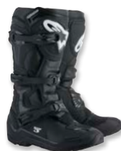
BLACK // 10