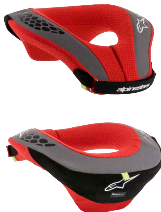
BLACK RED // 13