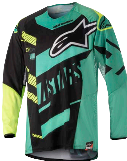
BLACK TEAL YELLOW FLUO // 1074