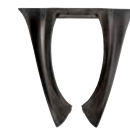
ATTACHMENT PLATE FOR BNS PRO 695 0114 10 BLACK ONE SIZE