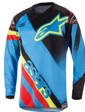
AQUA BLACK RED // 7113