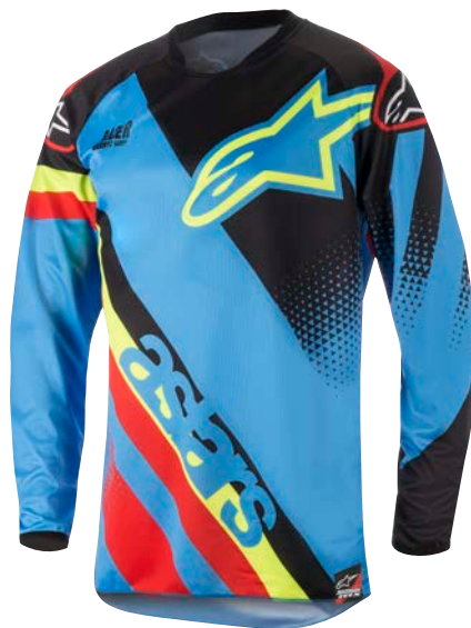
AQUA BLACK RED // 7113