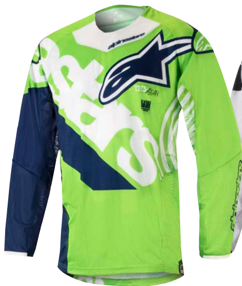
GREEN FLUO WHITE DARK BLUE // 629