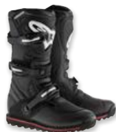
BLACK RED // 13