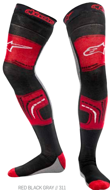
RED BLACK GRAY // 311