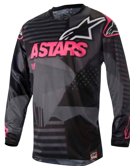
BLACK PINK FLUO // 1390