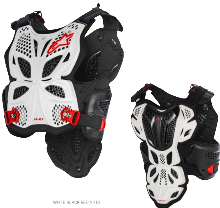
WHITE BLACK RED // 213