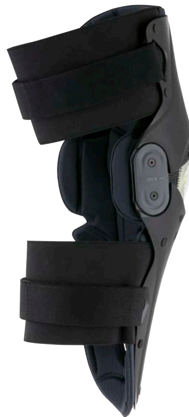
BLACK ANTHRACITE // 104