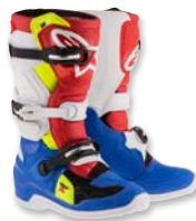
BLUE WHITE RED YELLOW FLUO // 7025