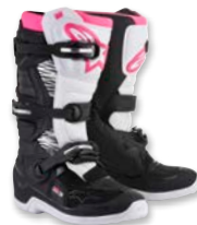
BLACK WHITE PINK // 130