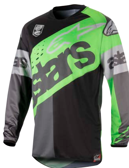
GREEN FLUO ANTHRACITE BLACK // 616