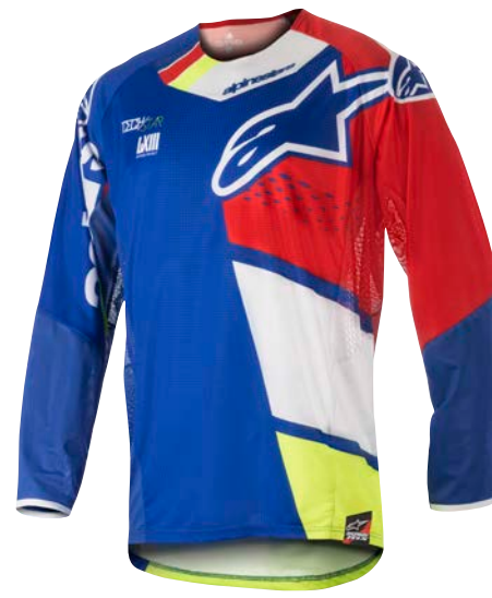
BLUE RED WHITE YELLOW FLUO // 7325