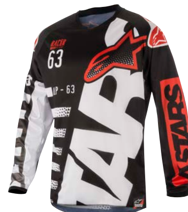
BLACK WHITE RED // 123