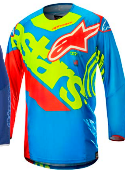
AQUA YELLOW FLUO RED // 7053