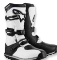
WHITE BLACK // 21