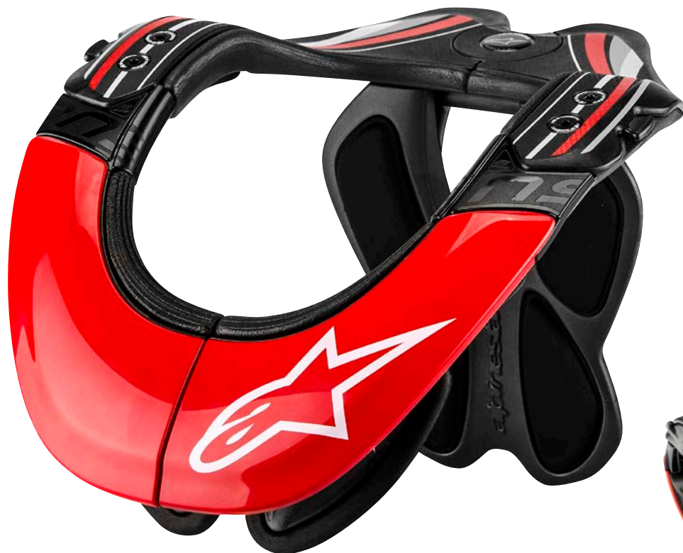
ANTHRACITE RED WHITE // 1430