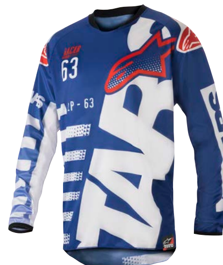
BLUE WHITE RED // 723