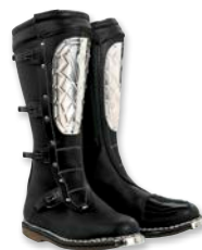
BLACK // N