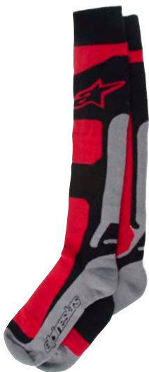
RED BLACK GRAY // 311