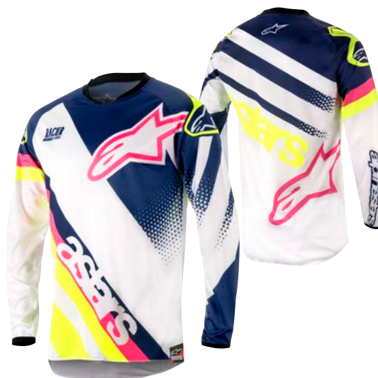
WHITE DARK BLUE YELLOW FLUO // 227