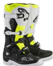
BLACK WHITE YELLOW FLUO // 125