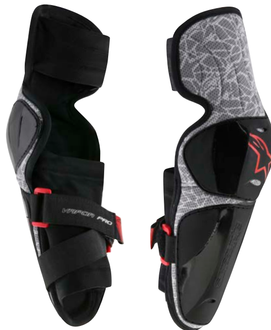
BLACK GRAY // 106