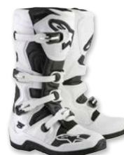
WHITE BLACK // 21