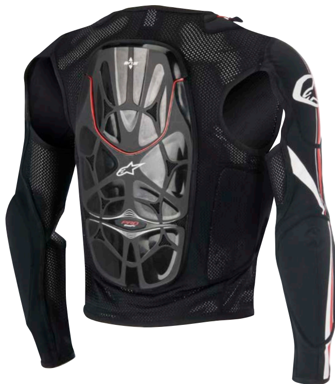
BLACK RED WHITE // 132