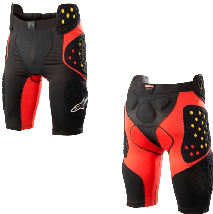
BLACK RED // 13