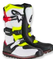
WHITE RED YELLOW FLUO BLACK // 2351