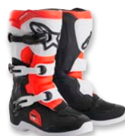
BLACK WHITE RED FLUO // 1231