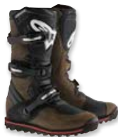
BROWN OILED // 818