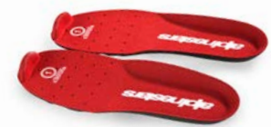
SIZE ADJUSTER FOOT BED TO REDUCE THE INTERNAL VOLUME BY ONE SIZE.