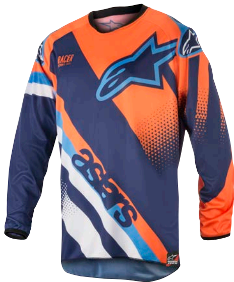
DARK BLUE ORANGE FLUO AQUA // 7049