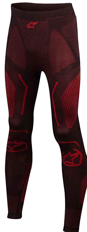
BOTTOM 475 2617 BLACK RED // 13