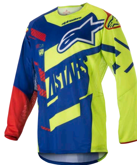
BLUE YELLOW FLUO RED // 754