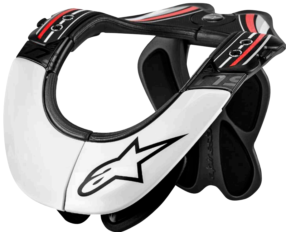
BLACK WHITE RED// 123