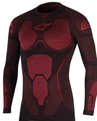
TOP 475 2517 BLACK RED // 13