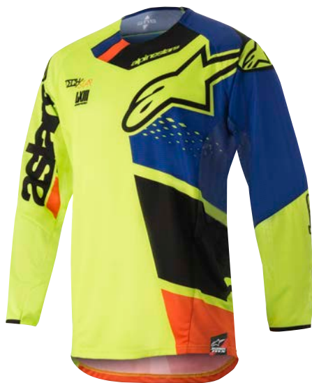
YELLOW FLUO BLUE BLACK ORANGE FLUO // 574