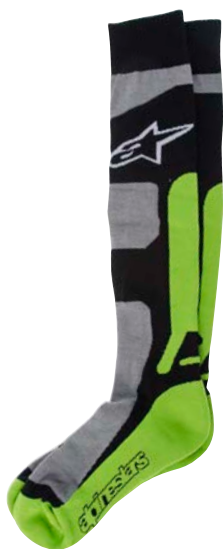
GRAY BLACK GREEN // 916