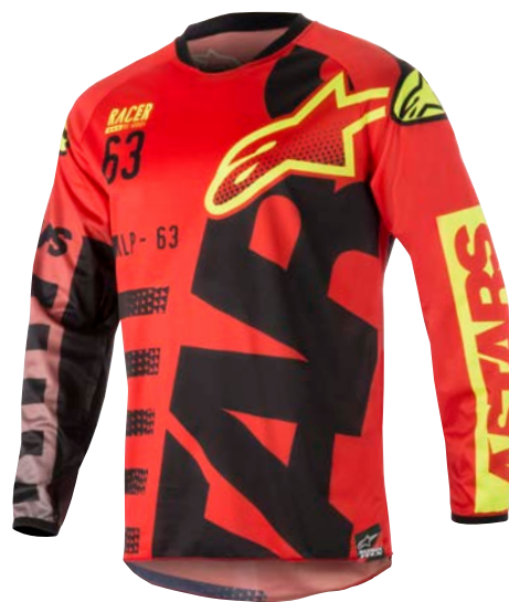
RED BLACK YELLOW FLUO // 316