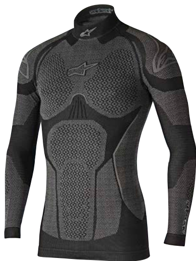
TOP 475 2117 BLACK GRAY // 106