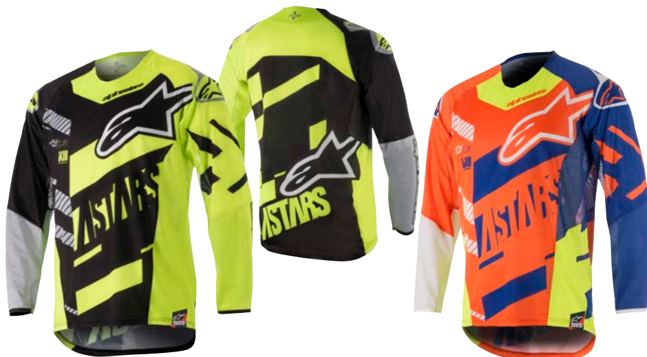
BLACK YELLOW FLUO GRAY // 1511