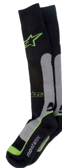
BLACK GRAY ORANGE // 174