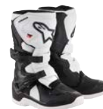
BLACK WHITE // 12