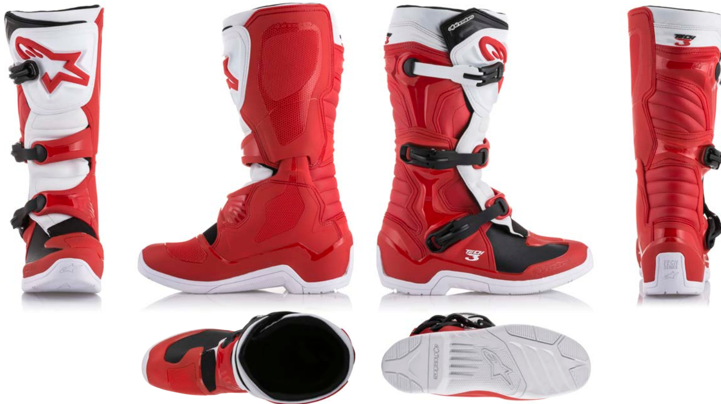
RED WHITE // 32