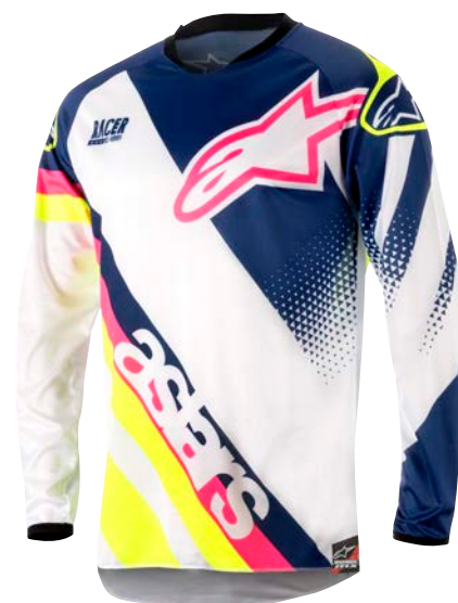
WHITE DARK BLUE YELLOW FLUO // 227