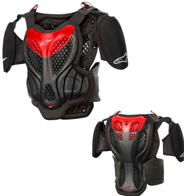
BLACK RED // 13