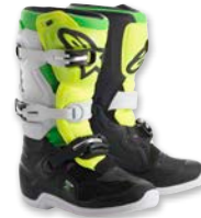
BLACK WHITE YELLOW FLUO GREEN FLUO // 1025