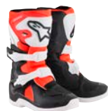
BLACK WHITE RED FLUO // 1231