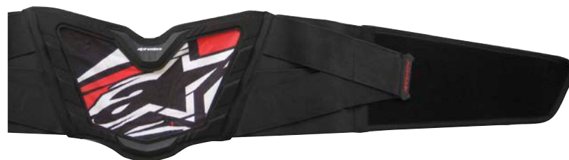
BLACK RED // 13