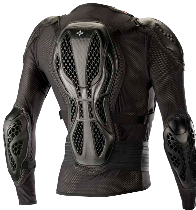
BLACK RED // 13