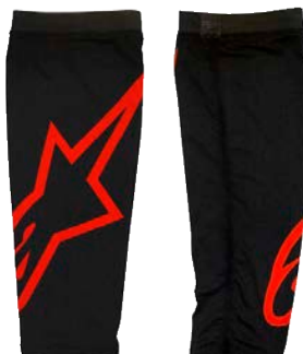
BLACK RED // 13