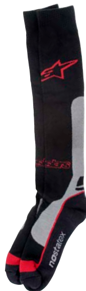
BLACK GRAY RED // 131