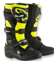
BLACK YELLOW FLUO // 155