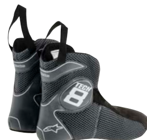
BLACK RED YELLOW FLUO WHITE // 1362