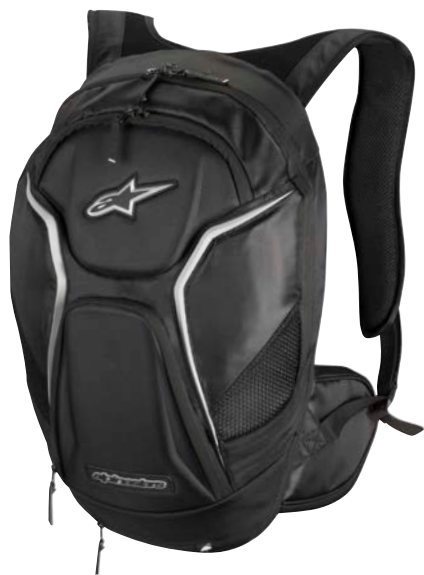
BLACK WHITE // 12