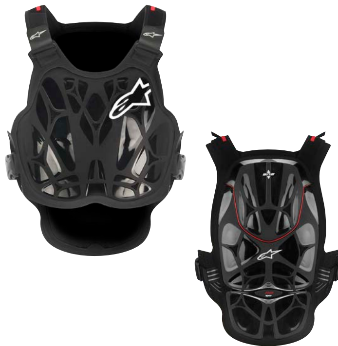
BLACK WHITE RED // 123