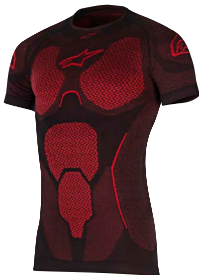
BLACK RED // 13