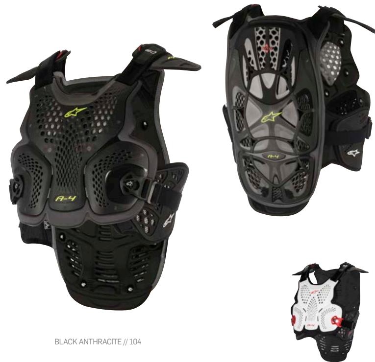
BLACK ANTHRACITE // 104