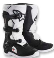
BLACK WHITE // 12