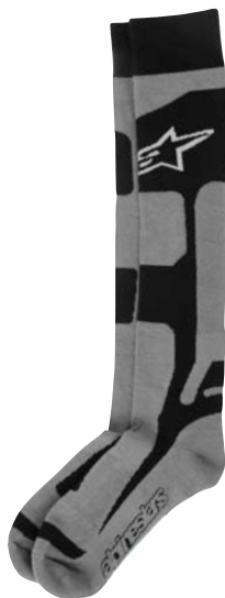
GRAY BLACK WHITE // 107