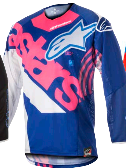
BLUE PINK FLUO WHITE // 7392