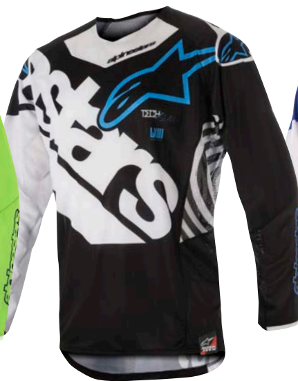
BLACK WHITE AQUA // 1279