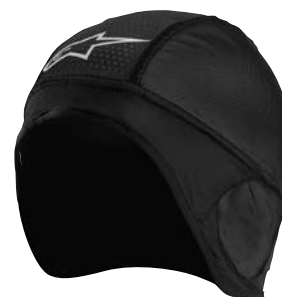
BLACK // 10