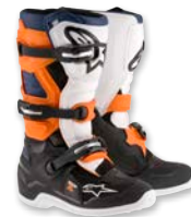
BLACK ORANGE WHITE BLUE // 1427