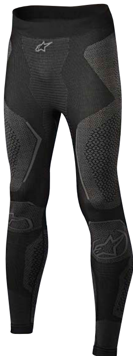
BOTTOM 475 2217 BLACK GRAY // 106