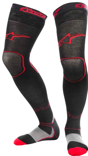
BLACK RED // 13