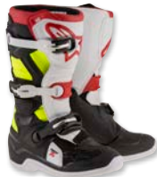
BLACK RED YELLOW FLUO // 136