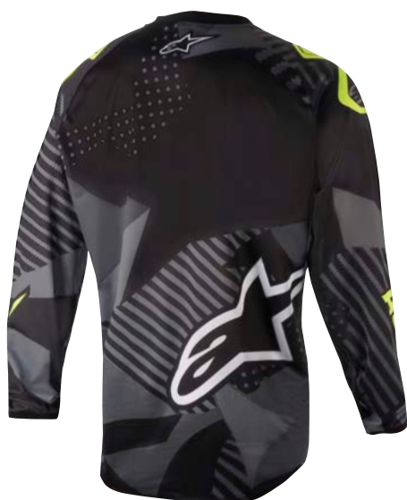
BLACK YELLOW FLUO // 155