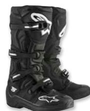
BLACK // 10