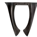
ATTACHMENT PLATE FOR BNS TECH CARBON 695 0014 10 BLACK ONE SIZE