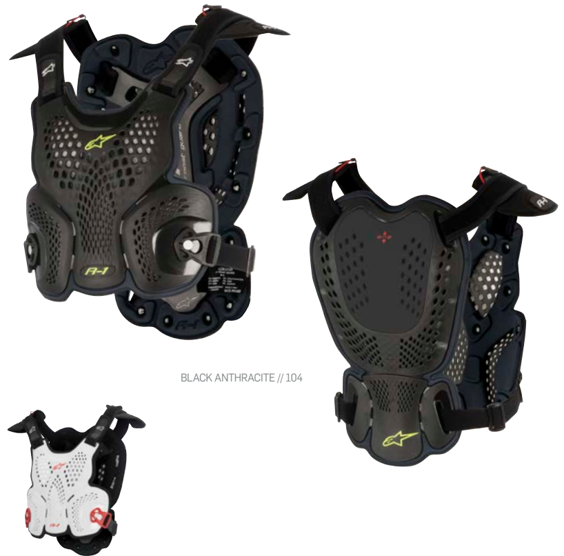
BLACK ANTHRACITE // 104