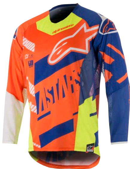
ORANGE FLUO BLUE WHITE YELLOW FLUO // 475