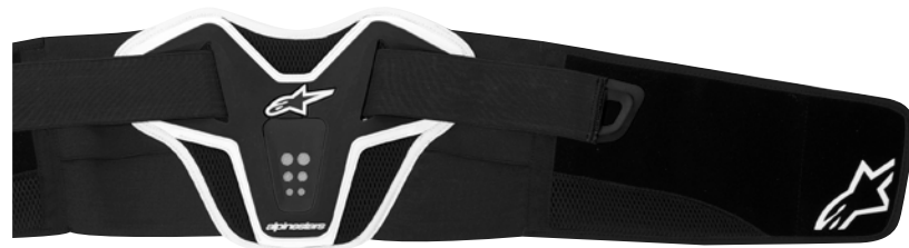
BLACK WHITE // 12