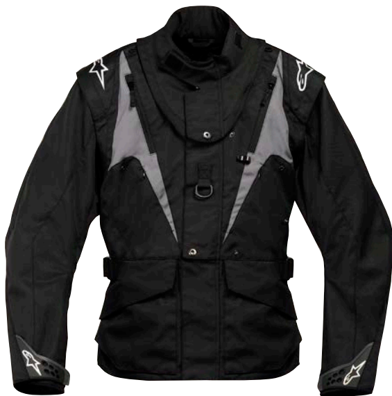
BLACK ANTHRACITE// 104